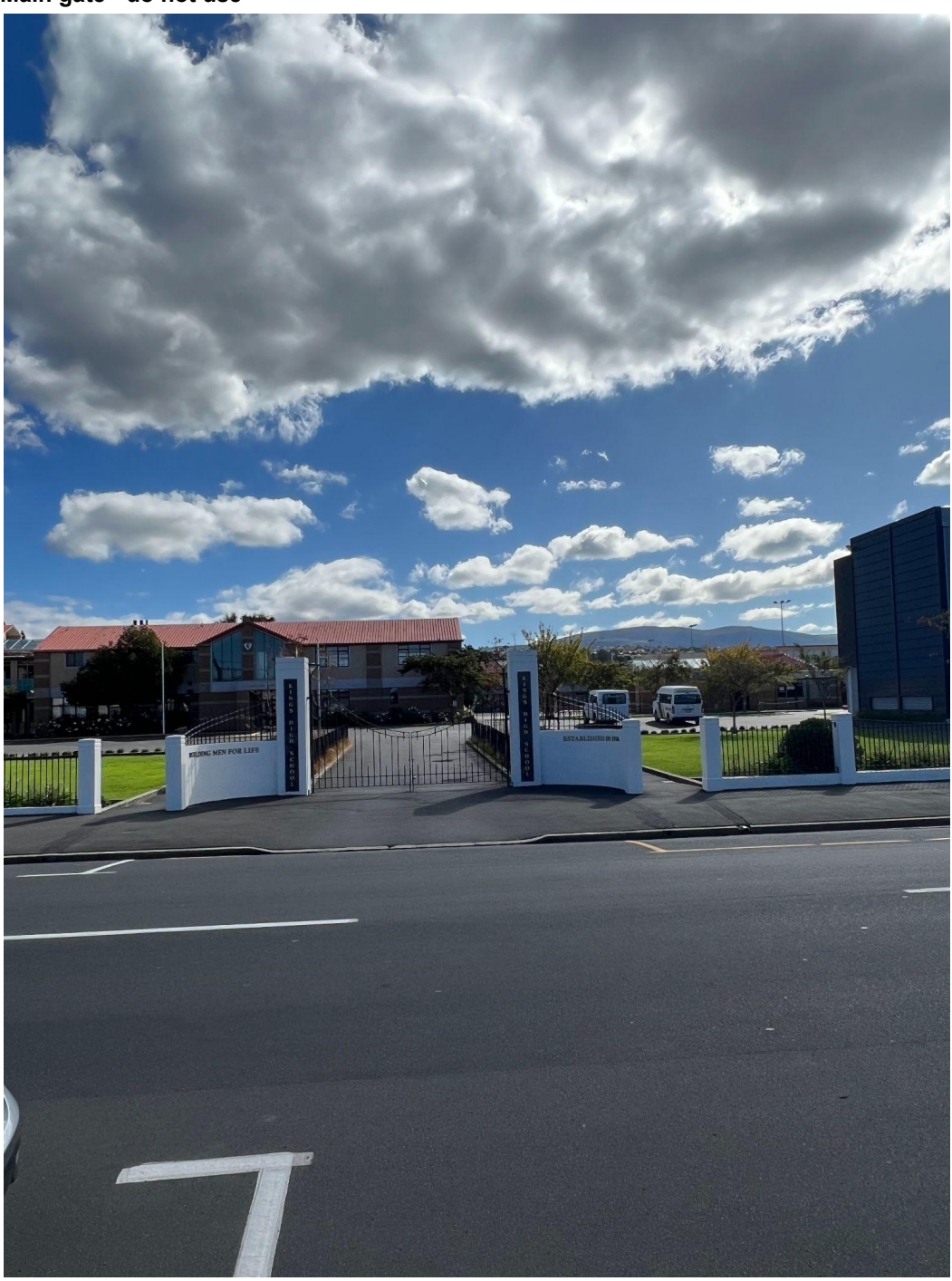
Main gate - do not use